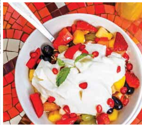
CLOCKWISE FROM TOP LEFT: The terrace and the room entrance at Sunbeam are among the few perfect spots to laze around for hours; colourful papier mâché elephants for sale at the weekly flea market; a mehfil in action; St. Cajetan Church was originally a chapel; a colourful breakfast at one of the many cafes in Assagao.