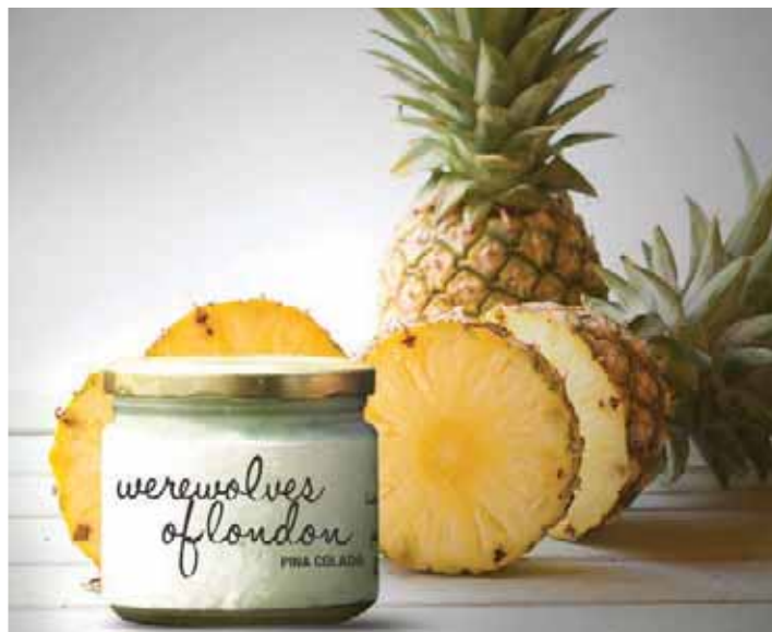
The Villa; Hice Cream