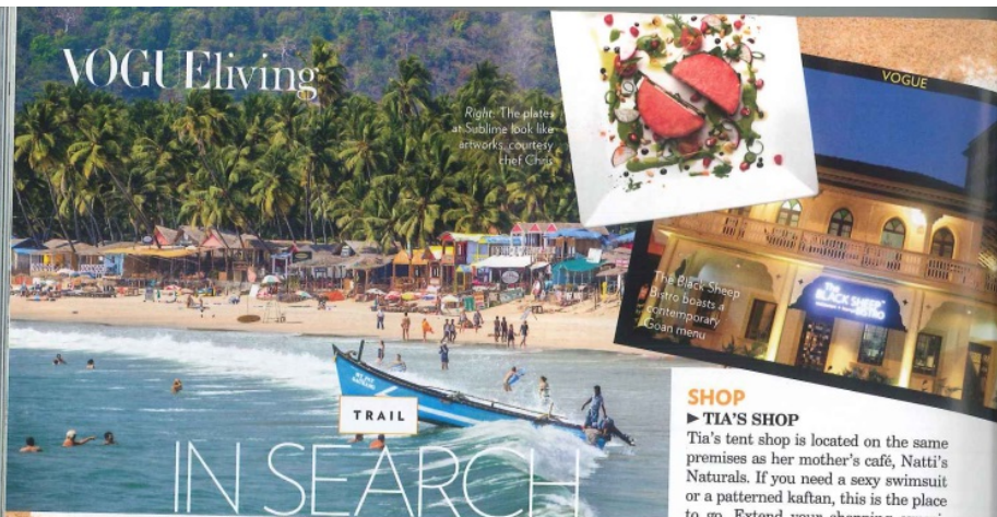
Right: The plates as Sablime food illustrations by Chef Ch...