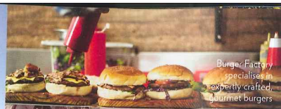
Burger Factory specialises in expertly crafted, gourmet burgers