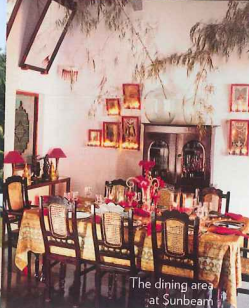
The dining area at Sunbeam