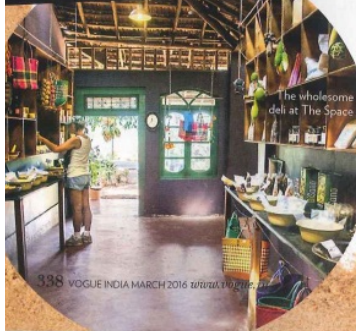
The wholesome deli at The Space