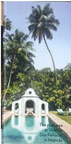
The pool area at Vivenda Dos Palhacos in Majorda